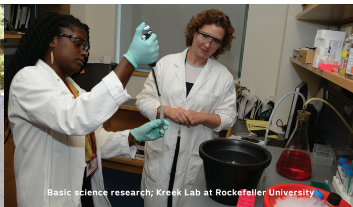
Basic science research; Kreek Lab at Rockefeller University