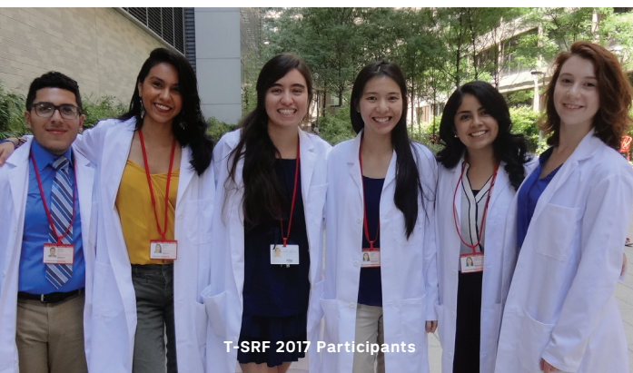
T-SRF 2017 Participants