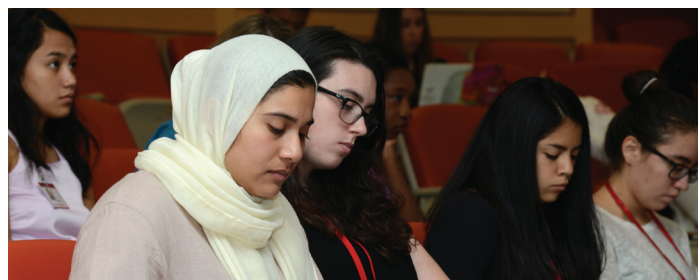
Attending lectures on health care