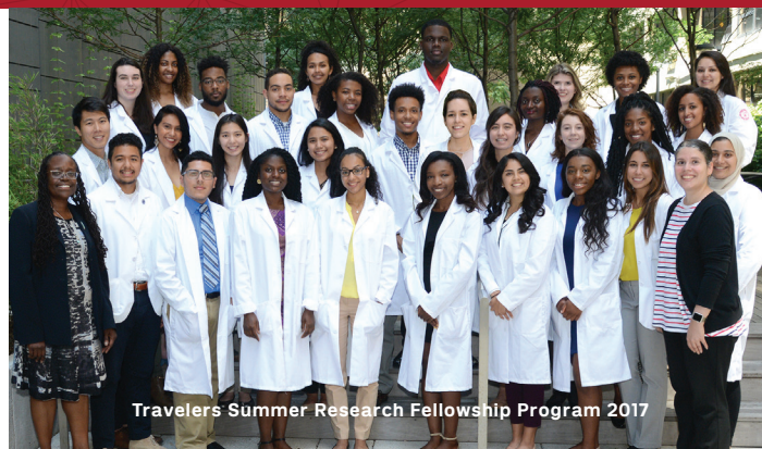
Travelers Summer Research Fellowship Program 2017

Weill Cornell Medicine 445 East 69th Street, Room 110 New York, NY 10021 212-746-1057 tsrf@med.cornell.edu